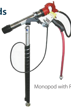
Monopod with Rivet Buster

Weighing only 27 pounds Monopods are designed to support demolition tools during operation, the Monopod provides rivet buster support, needle scaler support, and chipping hammer support. The Monopod will also provide pneumatic lift and pneumatic support for any tool that fits the aluminum arbor mounting clamp.